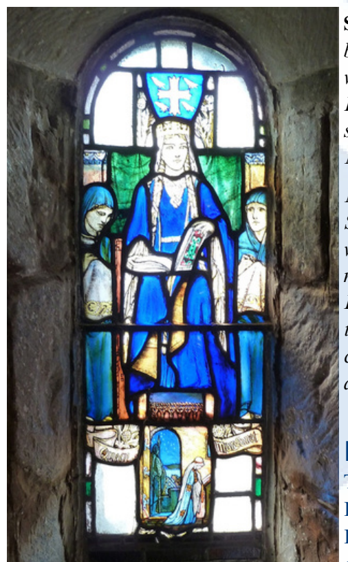
stained glass window in St. Margaret's Chapel in Edinburgh Castle.

We'll be marking our patron Saint with a parish-wide lunch after the 10:30 service and we could use some help with set-up and clean-up. We will be serving a catered meal. If you're available, please contact Traci at connection@saintmargarets.net .