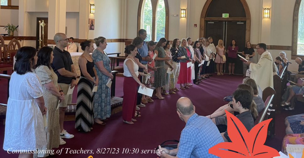
Commissioning of Teachers, 8/27/23 10:30 service