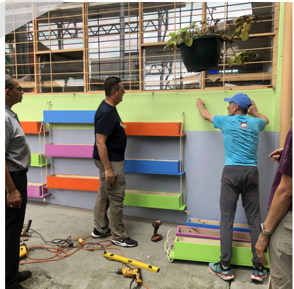
Costa Rica Mission work