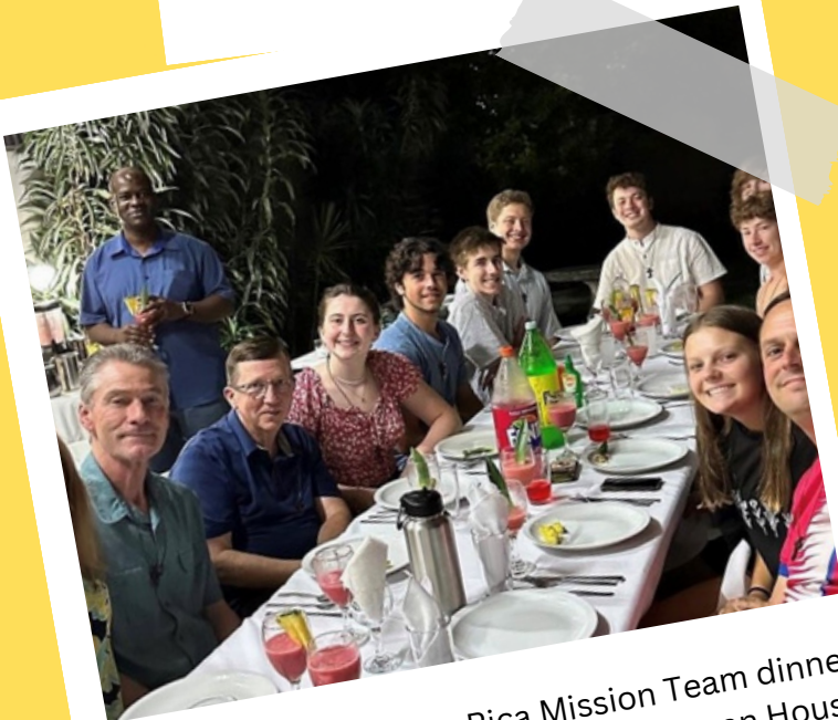
Costa Rica Mission Team dinner at the Diocesan House