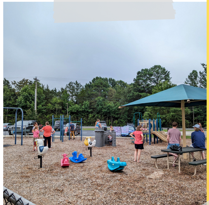
StMom's Summer Session Playgroup