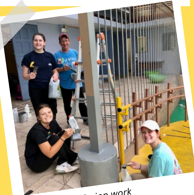
Costa Rica Mission work