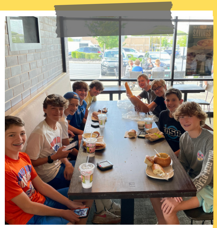
EYC Middle Schoolers out for dinner in Waverly.