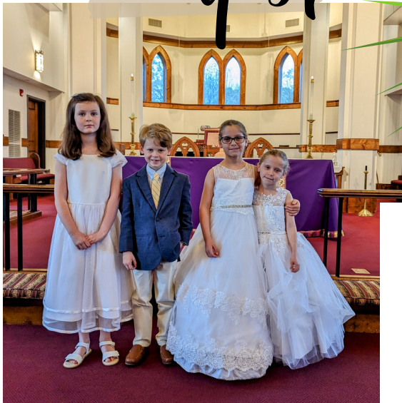
Holy Communion Celebration Day