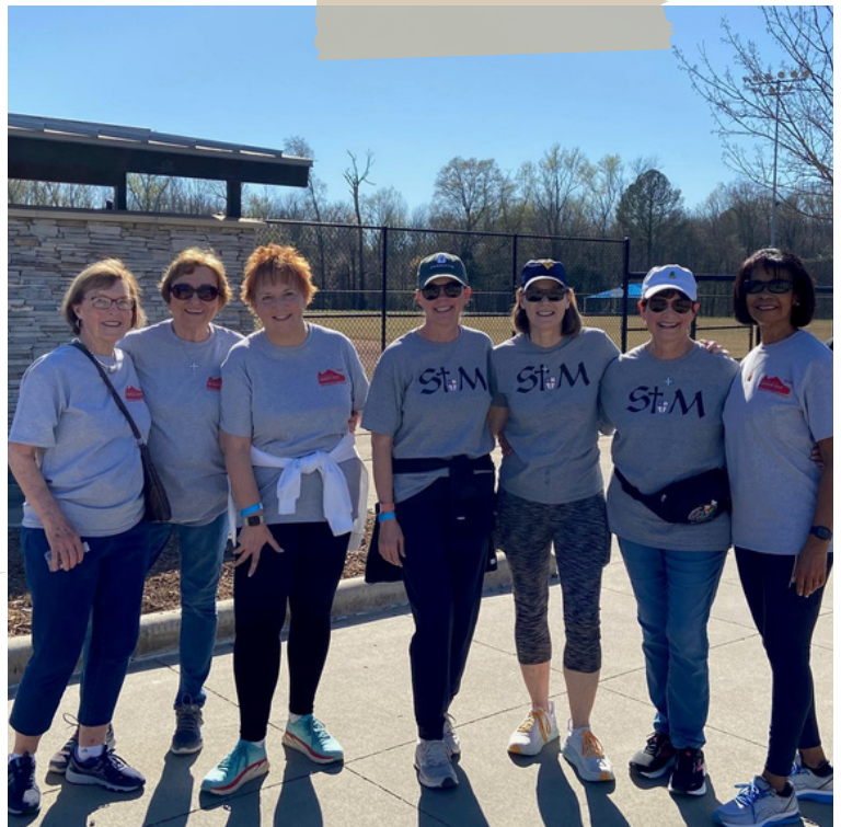
Team StM earned 2nd place for fundraising for Common Heart's Hunger Walk in Indian Trail.