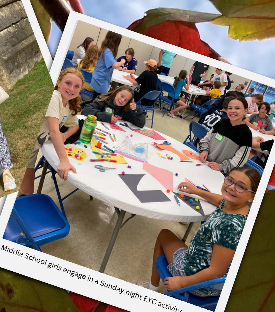
Middle School girls engage in a Sunday night EYC activity.