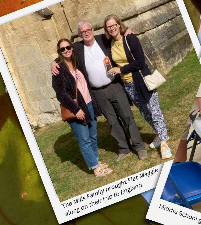
The Mills Family brought Flat Maggie along on their trip to England.