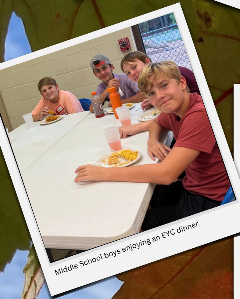
Middle School boys enjoying an EYC dinner.