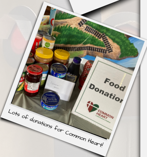
Lots of donations for Common Heart!