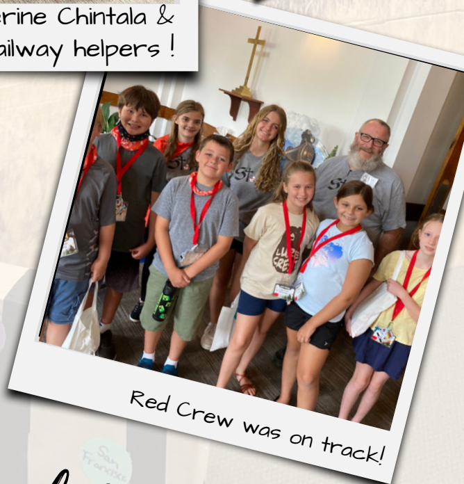
Red Crew was on track!