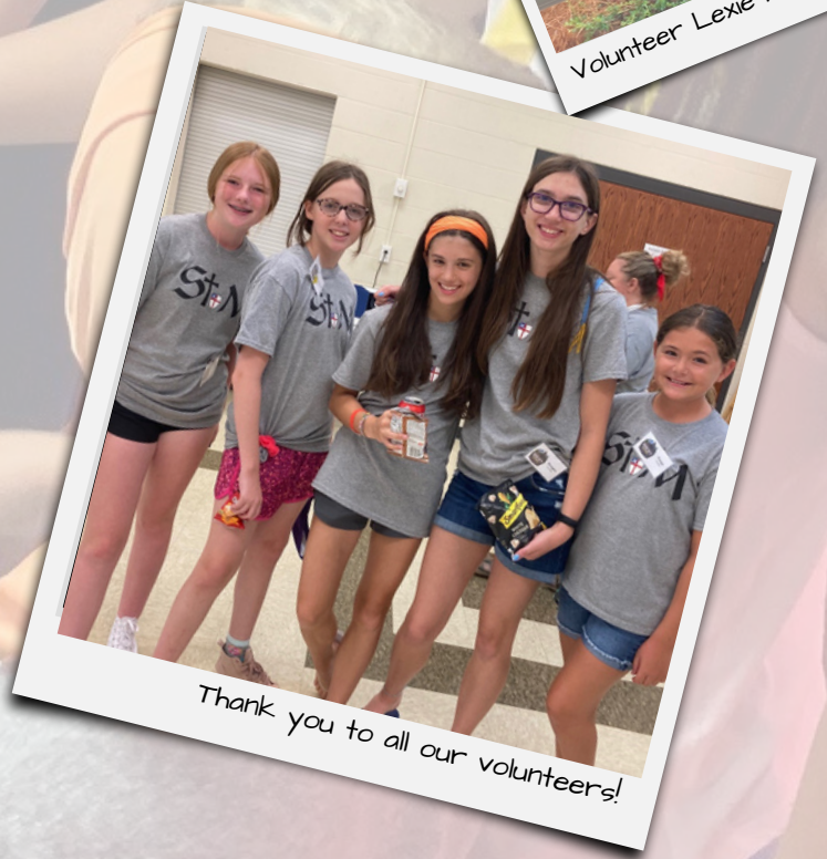
Thank you to all our volunteers!