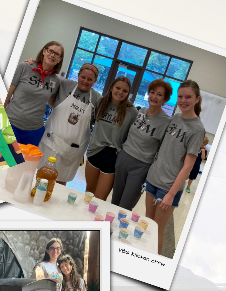
VBS Kitchen crew