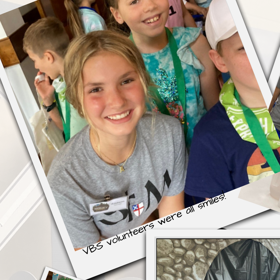
VBS volunteers were all smiles!