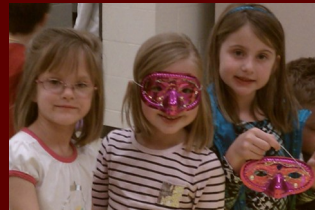
Shrove Tuesday 2011