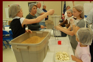
Stop Hunger Now Event 2011